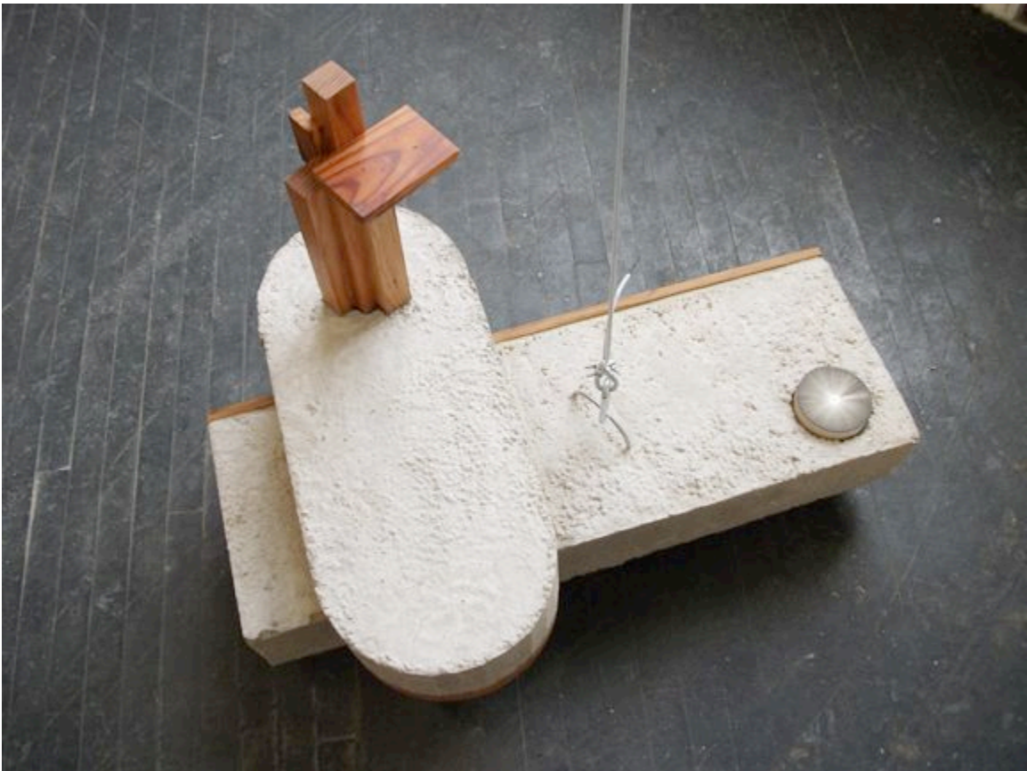
Counterweight: concrete, hardware, wood, silverpoint drawing

500 W Cermak Rd #727, Chicago, IL 60616 • www.peregrineprogram.com • 312.752.7375 ed@peregrineprogram.com